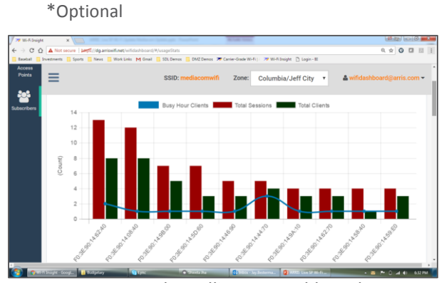
Network Intelligence Dashboard