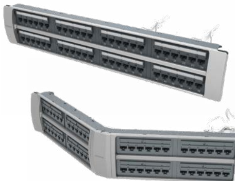
Flat or angled panels can be used

The CableGuide 360 platform features vertical cable managers (VCMs) and horizontal cable managers (HCMs). Both are specifically designed for ease of use, agile growth and superior cable organization and protection.