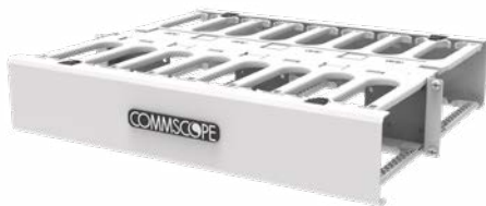
Rack mount units