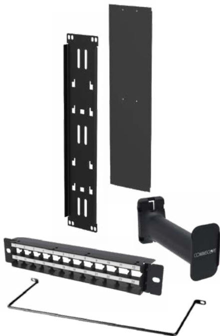
Cable spools and accessories

Cable protection, application support: Designed with SYSTIMAX innovation, CableGuide 360 solutions protect your copper and fiber cabling infrastructure—performance assured in writing.